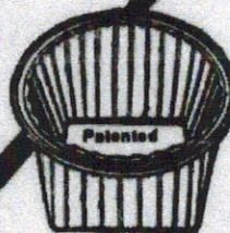
The Square Firepot

BOYNTON FURNACE COMPANY, 37th Street, near Broadway, New York